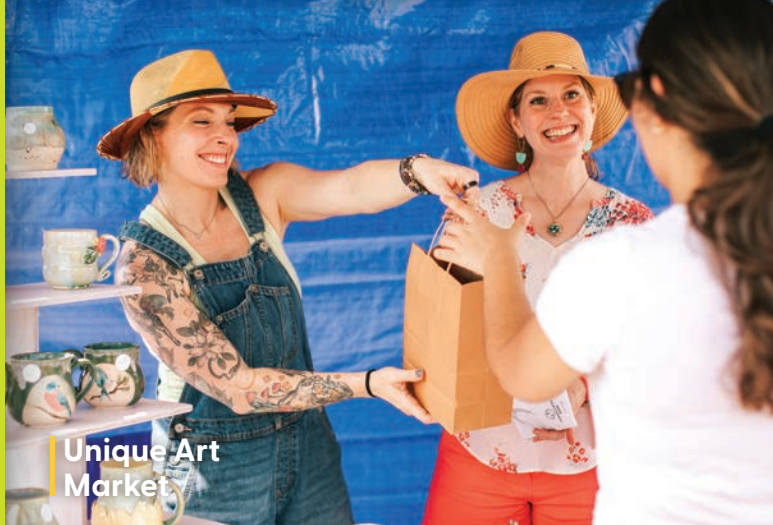
Unique Art Market