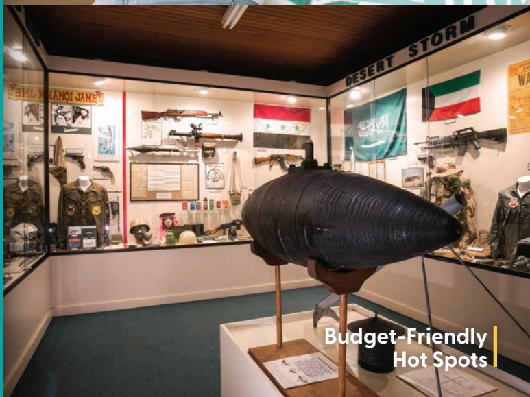
Budget-Friendly Hot Spots