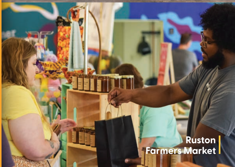
Ruston Farmers Market