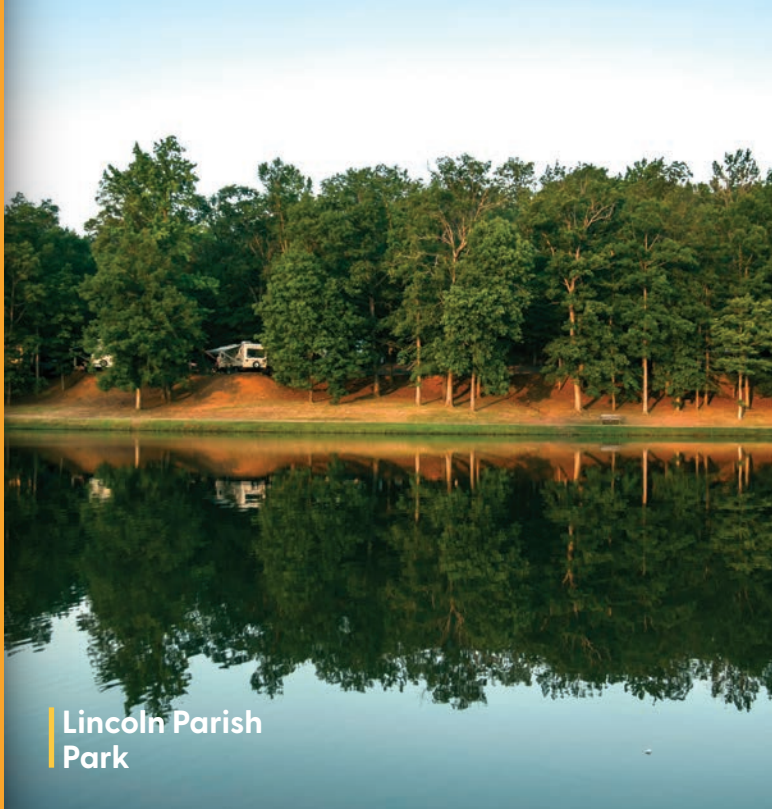
Lincoln Parish Park