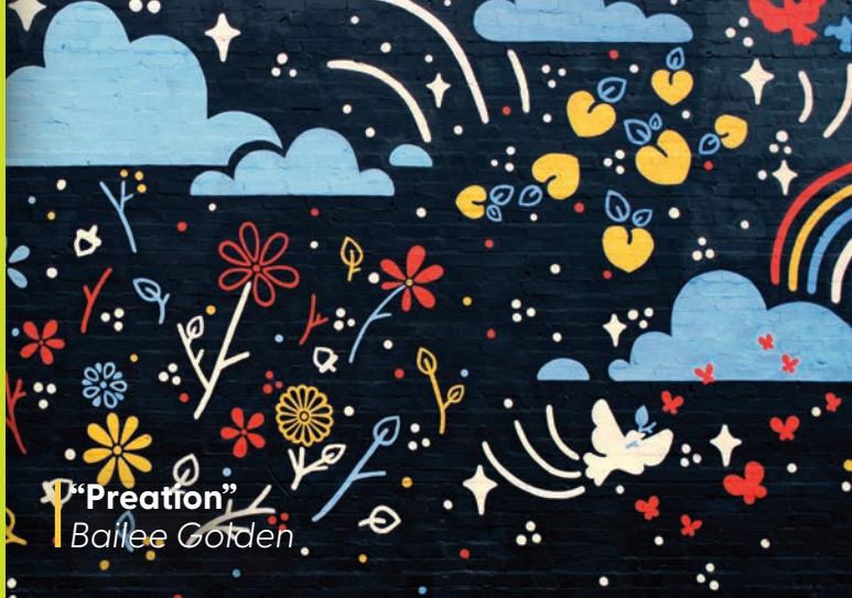
"Preatfon" Bailee Golden