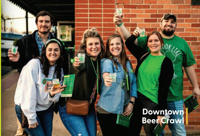
Downtown Beer Crawl