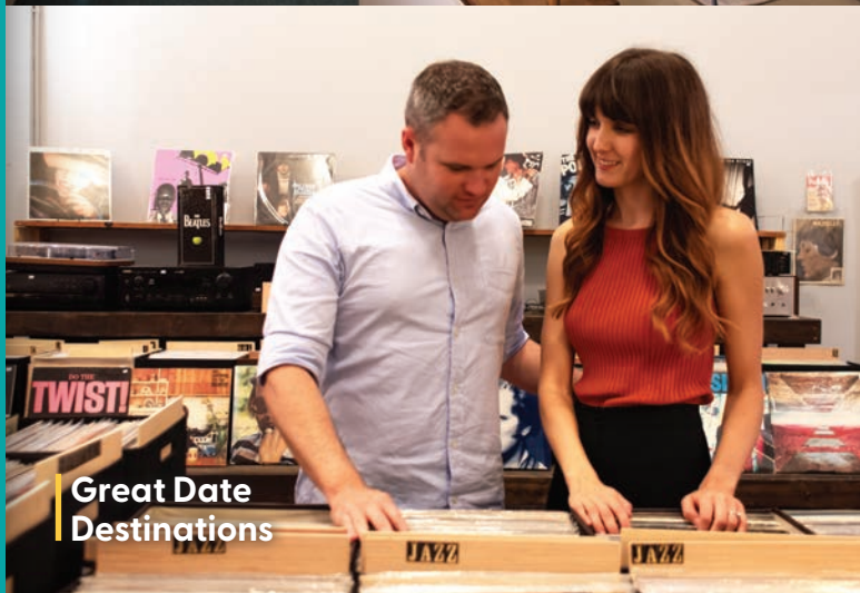
Great Date Destinations