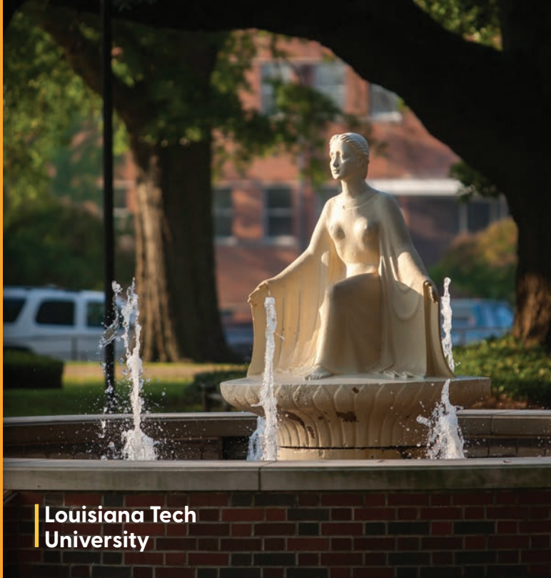
Louisiana Tech University