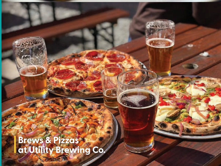
Brews & Pizzas at Utility Brewing Co.