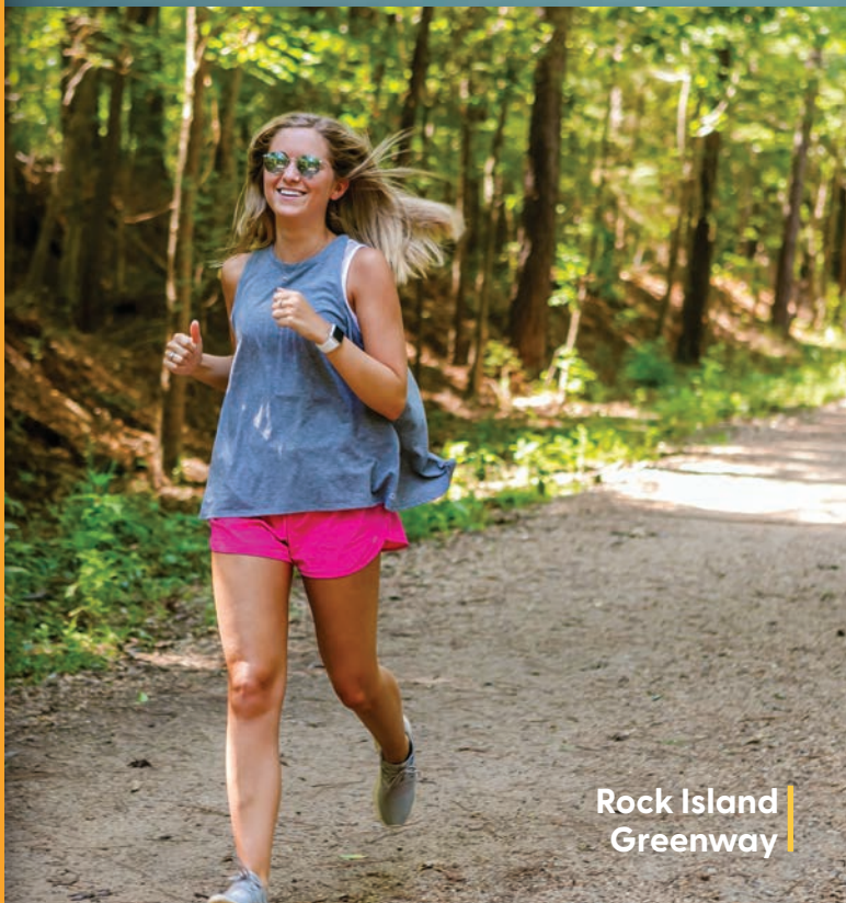
Rock Island Greenway