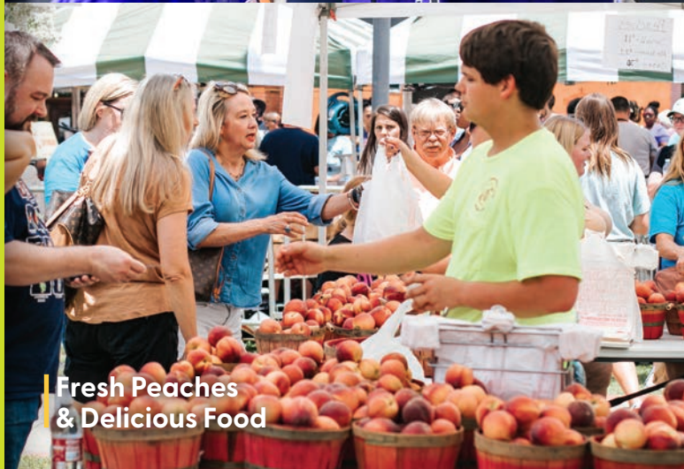
Fresh Peaches & Delicious Food