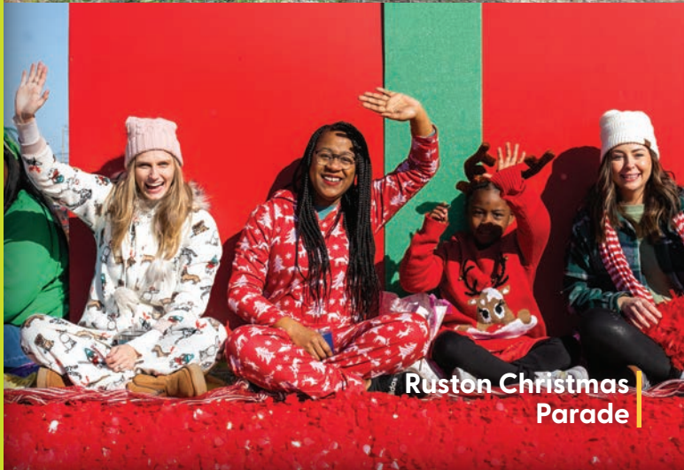
Ruston Christmas Parade