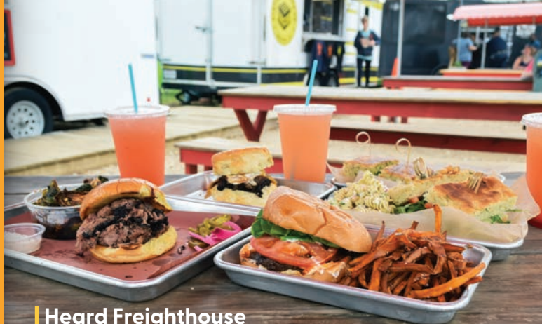
Heard Freighthouse Food Park