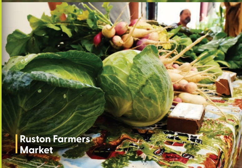
Ruston Farmers Market