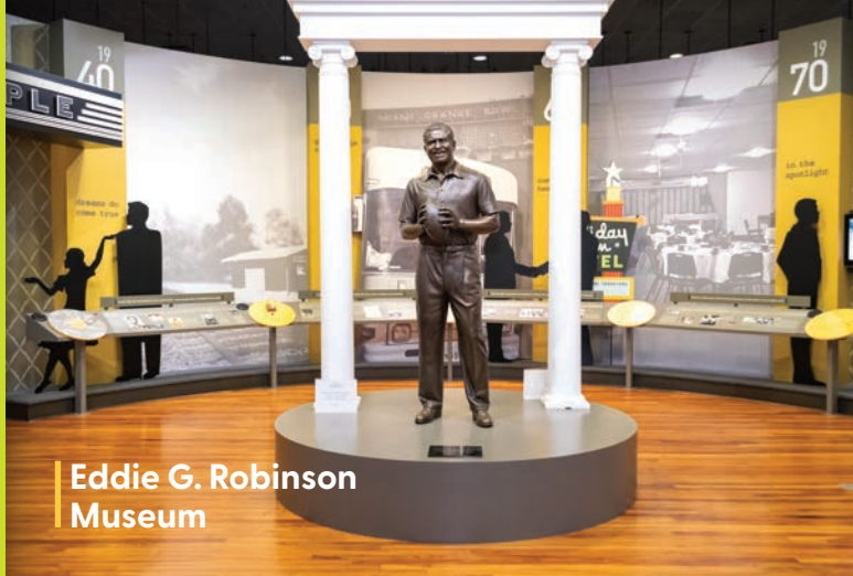
Eddie G. Robinson Museum