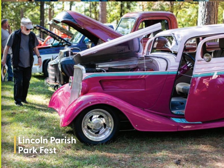
Lincoln Parish Park Fest