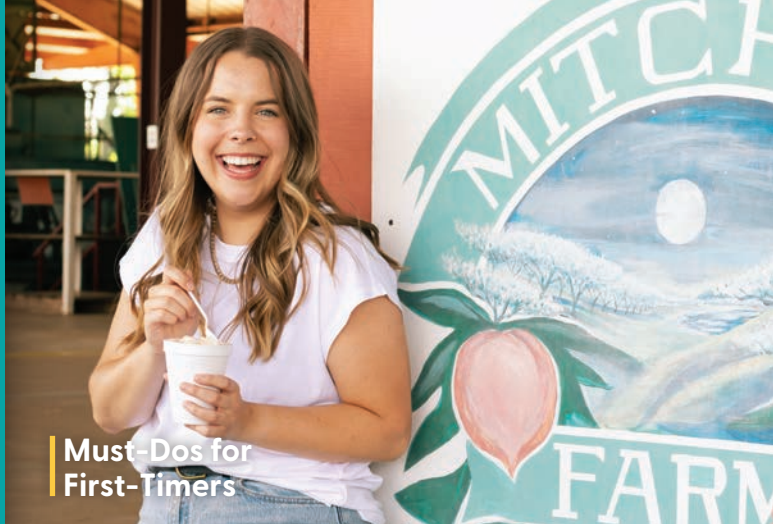
Must-Dos for First-Timers