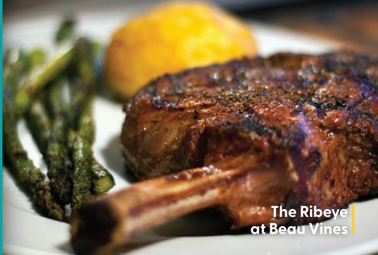
The Ribeye at Beau Vines