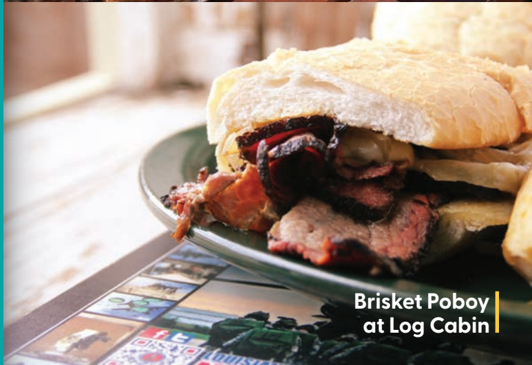
Brisket Poboys at Log Cabin