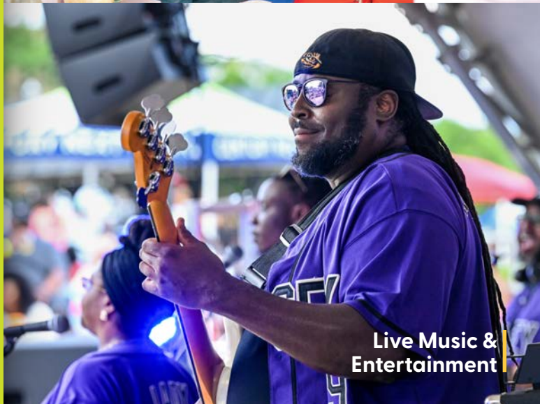
Live Music & Entertainment