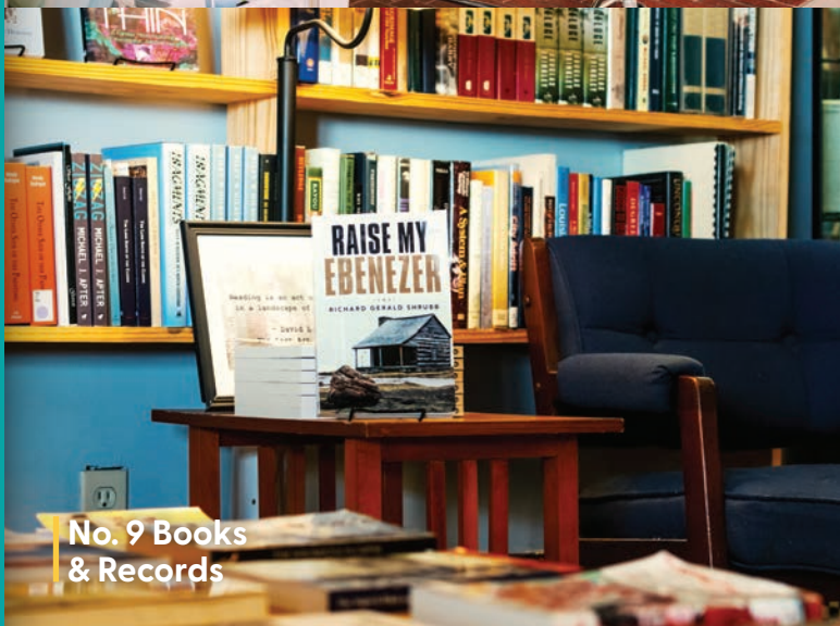
No. 9 Books & Records