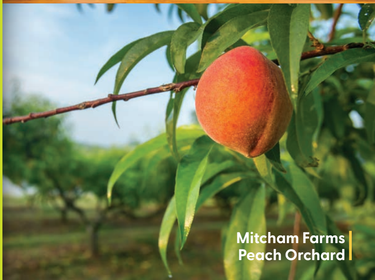
Mitcham Farms Peach Orchard