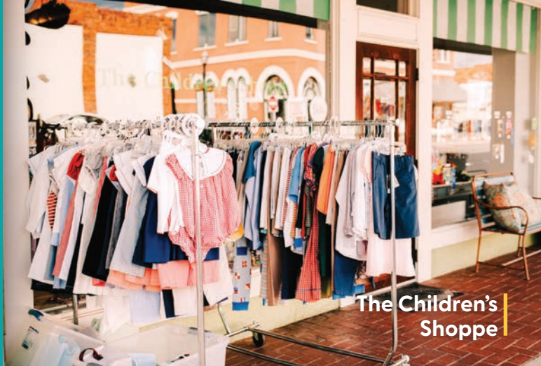
The Children's Shoppe