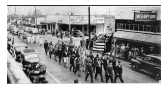
Military Parade marching down Third Street.